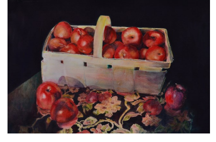
Shirley Woolard, CF Natures New Promise $750