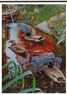
Rich Ernsting, CF Curly, Larry & Moe $2,500