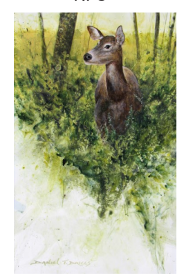
Daniel Driggs, WSI Deer in Hiding $1,500