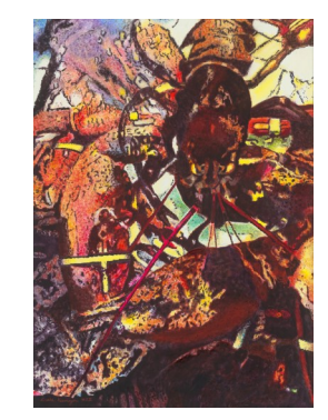
Diane Kiemeyer, WSI Market Price $2,000