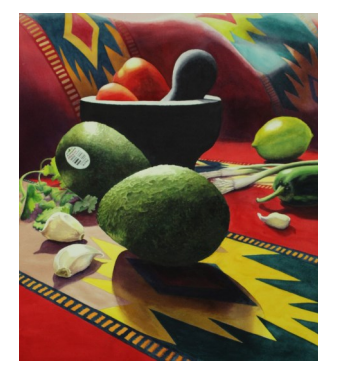
Jo Atkinson Belmont, WSI Guacamole $1,200