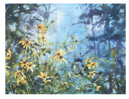
Rena Brouwer, CF Petals in the Sky $900