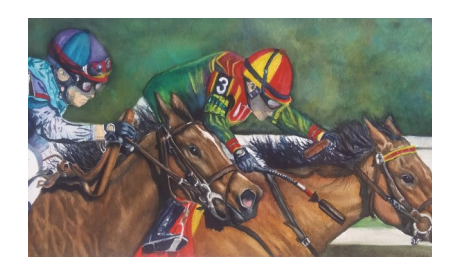
Dana Wright-Wiggins, WSI Eye on the Wire $600