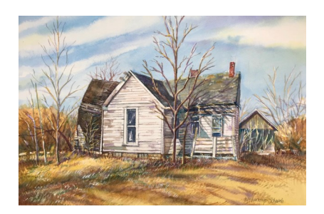
Mary Sue Veerkamp-Schwab The Old Homestead $950