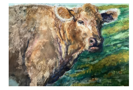
Judy Glore Moo $500