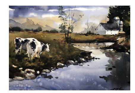
Thomas DeSomer Pendleton Stream $900