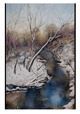
Brad Fields, WSI South Towards Geist $1,600