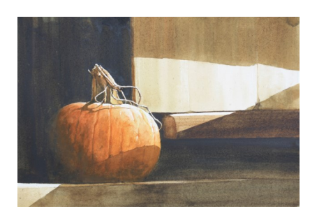
Allen Hutton, CF Boxed In $500