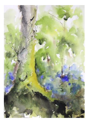
Robin Edmundson, WSI Bluebell Wood - Just Starting to Bloom $625