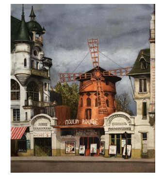
Tim Donaldson, WSI Moulin Rouge $2,100