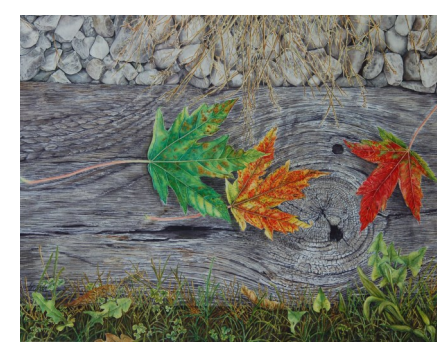
Brenda Pettigrew, WSI Railroad Tie Leaves $1,200