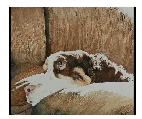
Brad Fields, WSI Sun Spot Baby $1,200