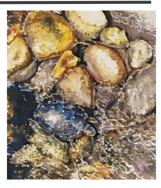
Brian Gordy, WSI Cooling Off $1,500