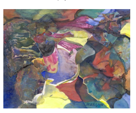
Dorothy Schulz Englehart, CF Emergence $1,400