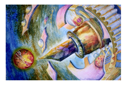
Bruce Gray, WSI How to Catch the Sparrow $900