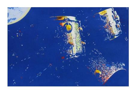
Kaarta Nemeth, WSI Rhythm of Space $350