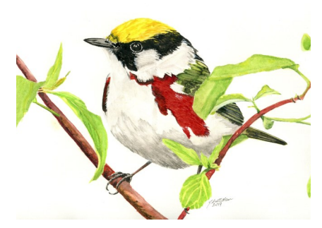
J. Scott Stan Chestnut Sided Warbler $750