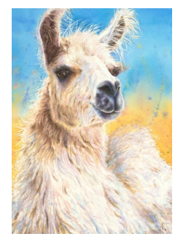
Cheryle Lowe, CF Llama $2,000