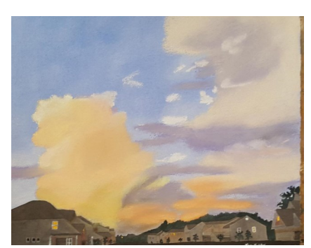
Tom Tuley, WSI Suburban Sunset $575