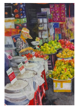
Ann Cole Rose, WSI Market Day-Hong Kong $1,000