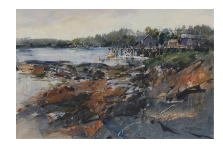
Jerry Smith, CF Rocky Edge $1,200