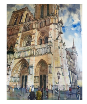
Janet Pribble Spring In Paris $500