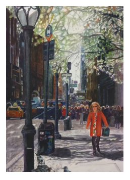
Diane Kiemeyer, WSI Shopping in the City $1,200