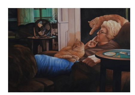
Rich Ernsting, CF Best Seat in the House $1,200