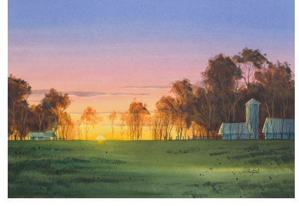
Larry Fentz Beckoning Glow $1,400