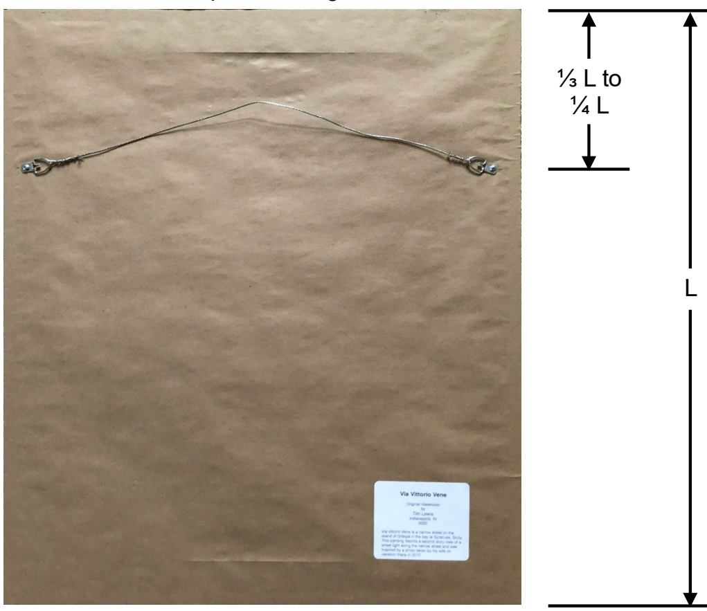
Top of Painting

Some have two mounting holes. One hanger must be attached to the back side of each vertical frame piece, located as shown. The hanging wire between the two hangers is optional for our show.