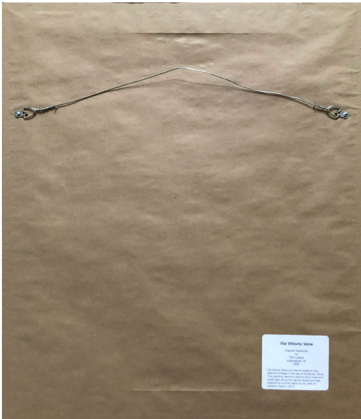
Top of Painting

Some have two mounting holes. One hanger must be attached to the back side of each vertical frame piece, located as shown. The hanging wire between the two hangers is optional for our show.