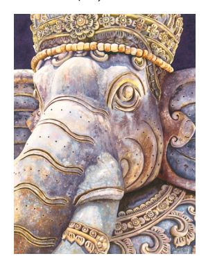
Cheryl Lowe, CF Queen E $2,000