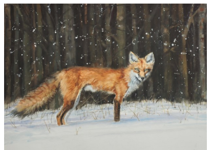
Diane Wunderlich, WSI Out of the Shadows $1,000