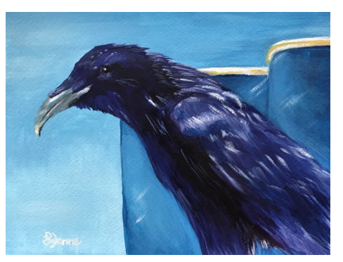
Lylanne Musselman The Raven Never Flitting, Still is Sitting $425