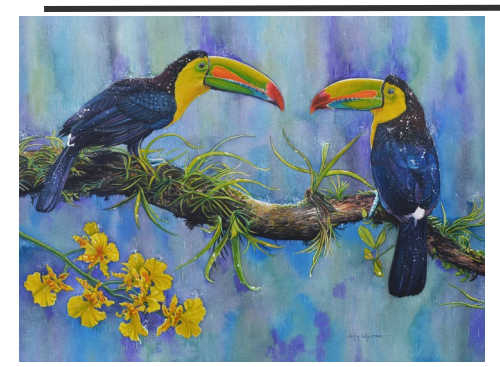
Wesley Merritt, WSI Rainforest Toucans $2,400