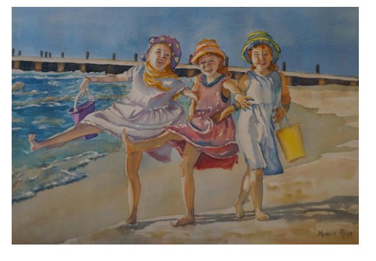
Maggie Rapp, WSI Beach Chorus Line NFS