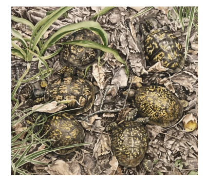
Brian Gordy, WSI Variations on the Eastern Box Turtle NFS