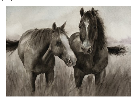
Nancy Wozniak Besties $350