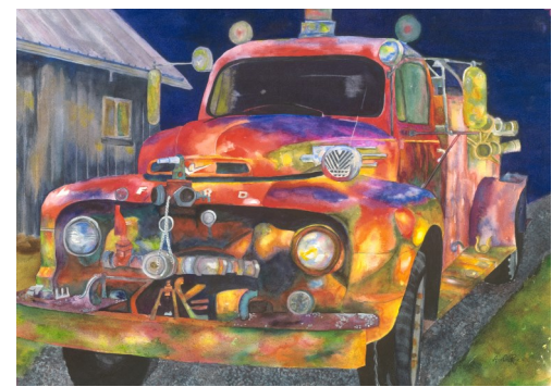
Ann Cole Rose, WSI Extinguished $750