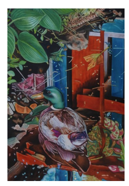
Rich Ernsting, CF Fowl Play $2.500