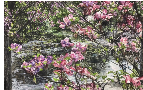
Patricia Hooper, CF Ballantra Pond $1,100