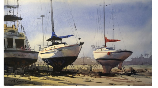
Tom DeSomer, WSI Drying Out $1,500