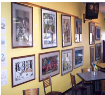
EXHIBIT SPACE EAGLE CREEK COFFEE COMPANY

Mix above ahead and place in refrigerator for awhile. Spread softened cream cheese on a plate. Place chicken mixture on cheese. Add at least 1/2cup LaChoy Sweet and Sour Sauce (red sauce) Chopped cashews can be added to the top if no